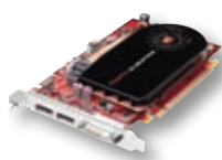
ATI FirePro™ V5700