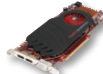
ATI FirePro™ V7750